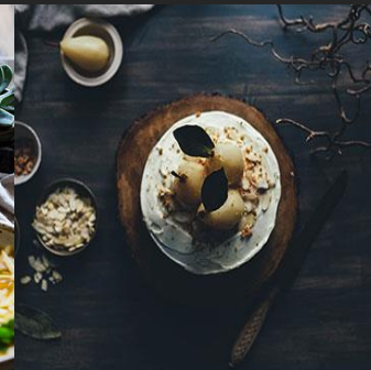
Urban farm restaurant