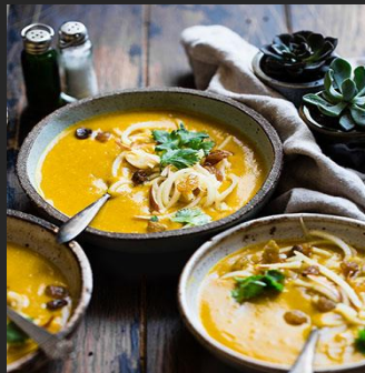
Thai vegetarian restaurant