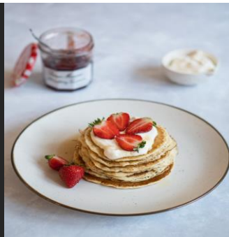
Western vegan restaurant