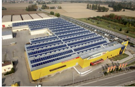
9,8 MWp, Italy