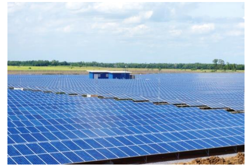
44 MWp, Thailand