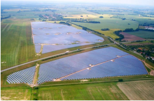
35 MWp, Germany