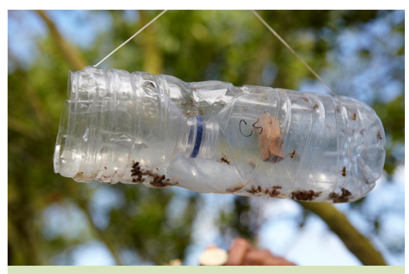
Farmers are using bio-pesticide (attractant) against fruit flies. The trap is made from used water bottle. Our project introduces new bait made from wood which can release the aroma slowly and constantly up to 3 months; so it can catch more fruit flies in the field and it's more economical.

agri-food systems must also be profitable for supply chain actors, such as farmers, processors, traders and input suppliers.