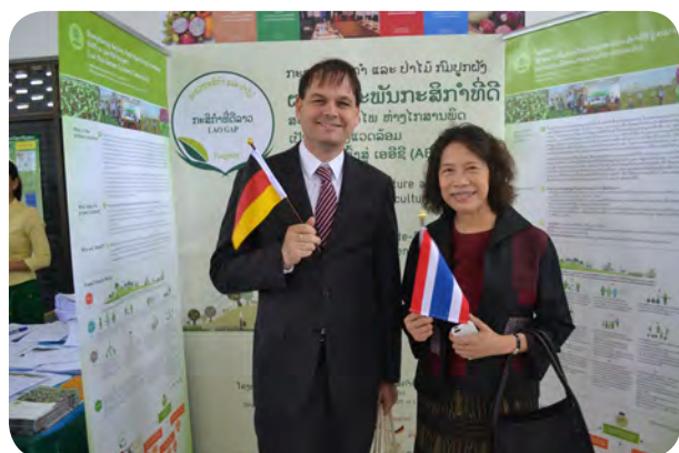
▲ Deputy Director of Thailand International Development Cooperation Agency (TICA) and the Country Director of the GIZ Thailand joined the Lao GAP certified Fruit and Vegetable Exhibition and Fare

“ We have to adapt ourselves to changes in the age of globalization. We have to enhance competitiveness and walk at the forefront along with the global community...The success of the Lao GAP project under the Trilateral Cooperation Programme has shown that friendship, determination and collaboration from project partners to achieve the implementation goal had generated tangible results. This is a part of fostering the ASEAN Spirit, according to the motto of “One Vision, One Identity, One Community”