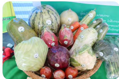
Example of fruit and vegetables currently under the Lao GAP certification scheme