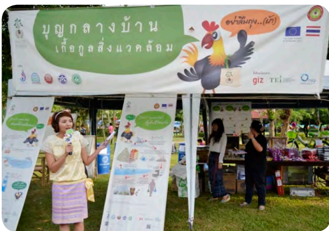
▲ Activities in the municipality of Phanat Nikhom

In Koh Samui, a popular island with tourists, the theme is water saving. The information campaign was held on 1 June 2014 at Central Festival Koh Samui. Different campaign materials encouraging tourists to take part in water saving actions have been produced and will be distributed.