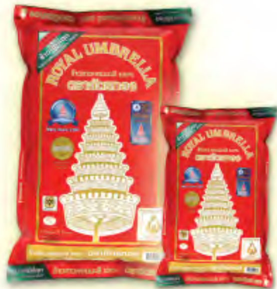
Royal Umbrella Thai Rice's factory in Ayutthaya is one of the pilot factories

The two companies will now prepare for level 5, where the challenge is to help their 1st tier suppliers to reach levels 2 or 3, and to conduct a survey in which 70 per cent of their neighbours express their satisfaction about the company (opinion survey). The SCP Policy Project - Thailand will help in training the suppliers and develop the methodology for the opinion surveys.