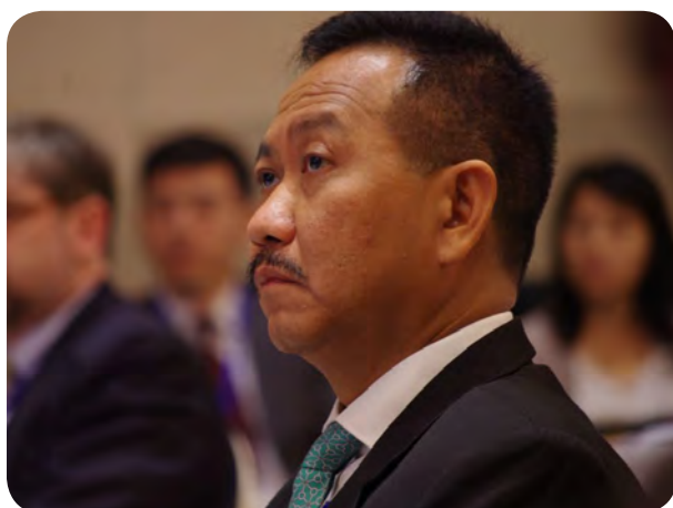
▲ Mr. Bambang Susantono, Vice Minister for Transportation of Indonesia

The freight and logistics sector is expected to triple in volume by 2050, with most of the growth happening in the developing world. It will spur economic development, but also bring numerous challenges. In financial terms, logistics costs are still very high in the region, with over 15% of GDP more than double the EU average. The negative environmental impacts are also increasing, as emphasised by keynote speaker Mr. Bambang Susantono, Vice Minister for Transportation of Indonesia. Air pollution, resource consumption and greenhouse gas emissions take a rising toll on public health and the environment. The impact of road transport is particularly severe.