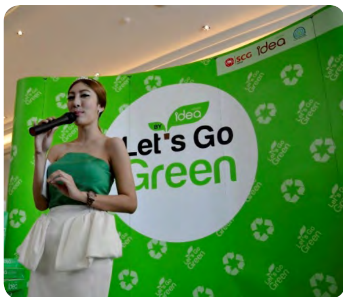
▲ SCG, one of the participating companies

These can be downloaded from www.SCP-Thailand.info .