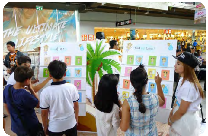
▲ Games and activities during “Save Water Save Samui” event

Waste minimization and reduction of plastic bags is the theme in Phanat Nikhom. The information campaign started in May and a dance contest based on the song about reducing plastic bags will be held towards the end of July. From 2-4 May, the Project set up a booth in Phanat Nikhom, offering such edutainment activities as quizzes and games to help participants learn more about the environmental impacts and life cycle of plastic bags.