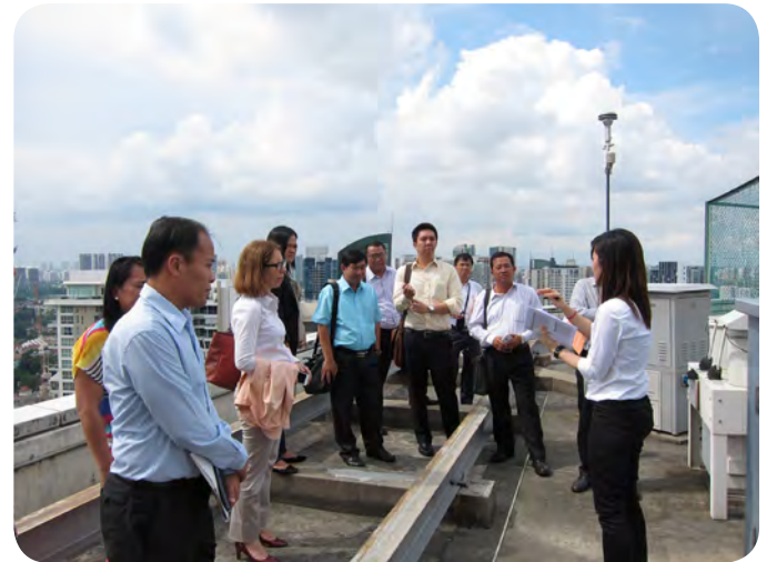
▲ At the roof top of building: The training participants visited one of the eleven ambient air quality monitoring sites in the Singapore.