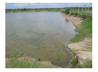
Farm preparation: Raising natural food chain for shrimps

After this workshop, TISTR, Damrong Farm and GTZ will disseminate this pond soil treatment technology to other farmers in the Southern region in order to promote its wider adoption in other farms. It is anticipated that by 2011, up to 1,500 farms will adopt this technique. After the completion of the project in 2011, the service will be made available commercially by Damrong Farm.